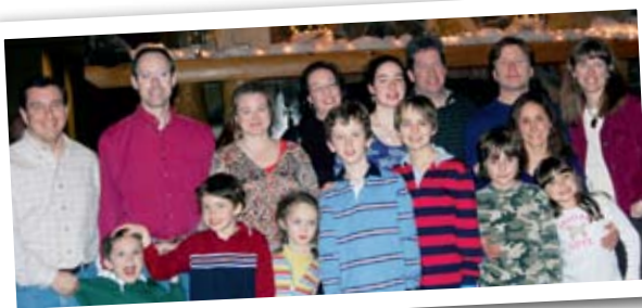
Alumni from the classes of 1989 and 1990 gathered with their children at Great Wolf Lodge in the Poconos in January.