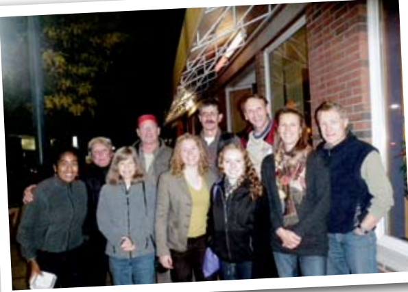
Members of the classes of 1976 and 1977 and their Eph children enjoyed Parents Weekend in Williamstown in the fall.