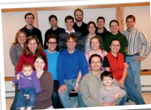
Alumni from the classes of 2001 through 2005 gathered with their families for a seventh annual New Year's celebration, which this year took place in Eastham, Mass.