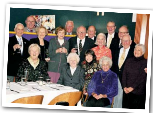
Eight members of the Class of 1949 dined with their spouses at Mezze in Williamstown during a minireunion in October.